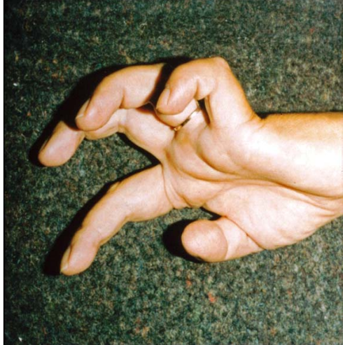
Image 2: spastic paresis of the left hand – claw hand after three years of treatment with electrical currents condition before beginning our exercise (seven years after a stroke)

Senso-motoric training treatments were conducted with 14 patients to increase the strength of the hand and the individual fingers . These were eight male and five female patients suffering from functional incomplete flaccid or spastic paresis plus one female patient with functional complete spastic paresis due to spasms of the flexor and extensor muscles of the finger (spastic claw hand), (image 2)