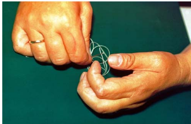
Image 4: Considerable decrease of finger spasm (claw hand before senso-motoric exercises), putting a thread through the eye of a needle and releasing it after 30 training sessions, active bending and flexing of all limbs of all fingers, carrying out nearly all household chores without extra help (visual control of activities, however, of the right hand due to lack of sensibility of proprioceptors)