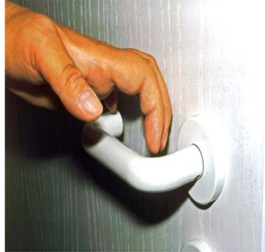
Image 3: decrease of the spastic patterns in posture and movement (claw hand), control over arm after seven years of paresis, ability to open and close door, front limbs of the fingers are in neutral position

Five patients received exercise treatments , four male and one female patient suffered from functional complete paresis with flaccid paresis of the finger flexors and spastic paresis of the finger extensors.