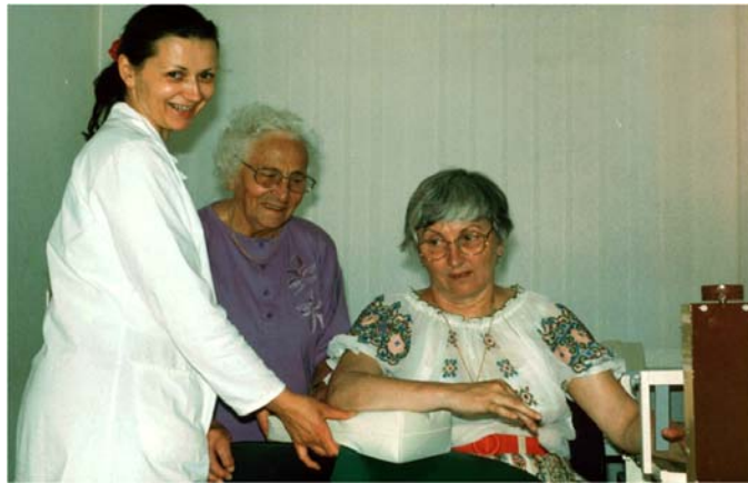
Image 5: Distinct stretching of finger III to V after approx. 50 training sessions, (visual control of the right hand necessary due to lack of sensibility of proprioceptors )

All patients' pathological innervation patterns such as spastic positions and movements as well as acroataxia improved significantly and permanently. Additional targeted and intensive treatments of individual functions and abilities were not pursued. The senso-motoric training and exercise sessions also had other positive effects such as improved speech, concentration and attention span, endurance performance of the lower extremity and the whole body.